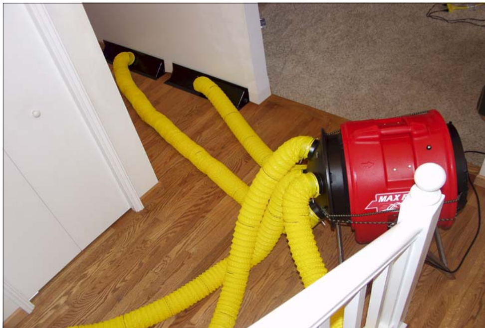
ADP-5 with Dry Air Technology's MAX Force

Under negative suction, air can be extracted from the wall cavity or area needing circulation, and either directed into the room, a dehumidifier, air scrubber, or outside. If a HEPA air scrubber is used, the end result is clean air, which can be put wherever desired.