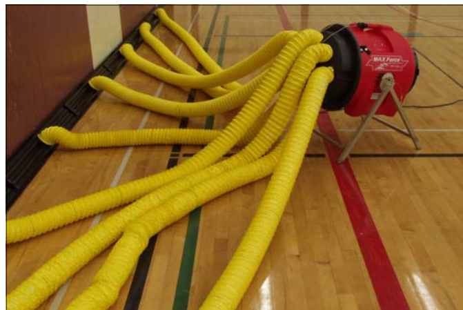
ADP-9 with Dry Air Technology's MAX Force

*NOTE: The newer model Phoenix Thermastor Guardians no longer have a sheet metal collar for the intake. To adapt the ADP-9 to the newer style Guardian or the older style without the collar, place the separate ring provided on the face of the Guardian port (on top of the unit) and then place the ADP-9 onto it.