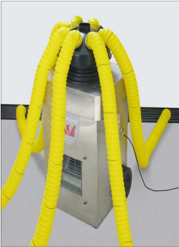
ADP-9 with Phoenix Guardian HEPA - drying negatively.

CAUTION: Do not use negative suction on an outside wall if the grains of moisture outside are excessively high.