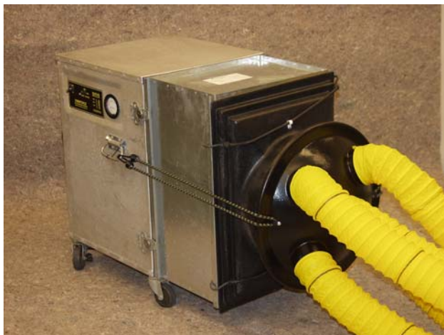
ADP-5 with Omni Force HEPA.