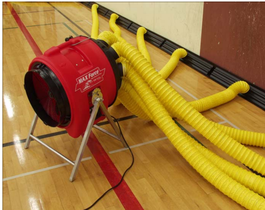
ADP-9 with Dry Air Technology's MAX Force

Under negative suction, air can be extracted from the wall cavity or area needing circulation, and be either directed into the room, a dehumidifier, air scrubber, or outside. If the Guardian HEPA is used, the end result is clean air, which can be put wherever desired.