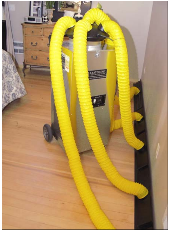
ADP-5 with Abatement Technologies PAS 1800 or 2400 HEPA - drying negatively.