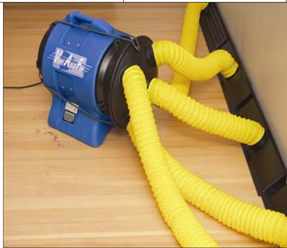
ADP-5 with Dry Air Technology's 12" Vane Axial Fan

*NOTE: The newer model Phoenix Thermastor Guardians no longer have a sheet metal collar for the intake. To adapt the ADP-5 to the newer style Guardian or the older style without the collar, place the separate ring provided on the face of the Guardian port (on top of the unit) and then place the ADP-5 onto it.